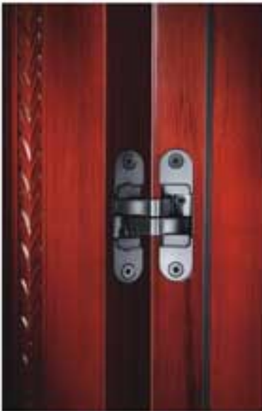
OPPEIN Vantini concealed hinge