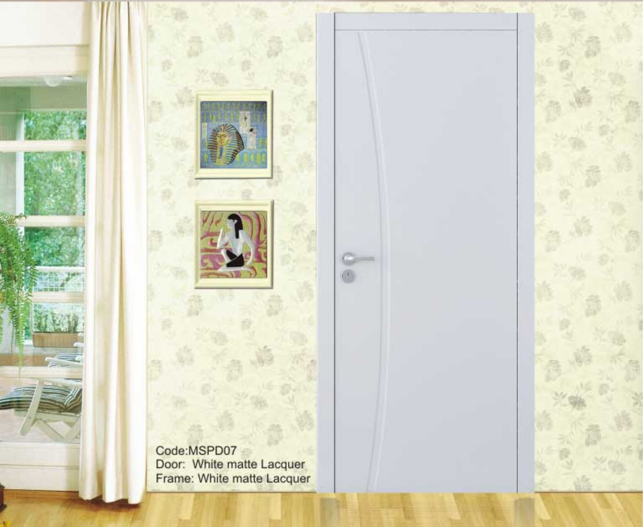
Code:MSPD07 Door: White matte Lacquer Frame: White matte Lacquer