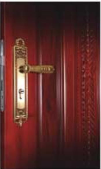
Germany Häfele ® hardware

Take the lead in using the European standard lock body and unify the size of hole for the lock body to minimize the installation error. Oppein Vantini has established strategic co-operations with international well-known hardware suppliers, such as Häfele ® of Germany. High quality hardware helps to consolidate Oppein Vantini's reliable quality.