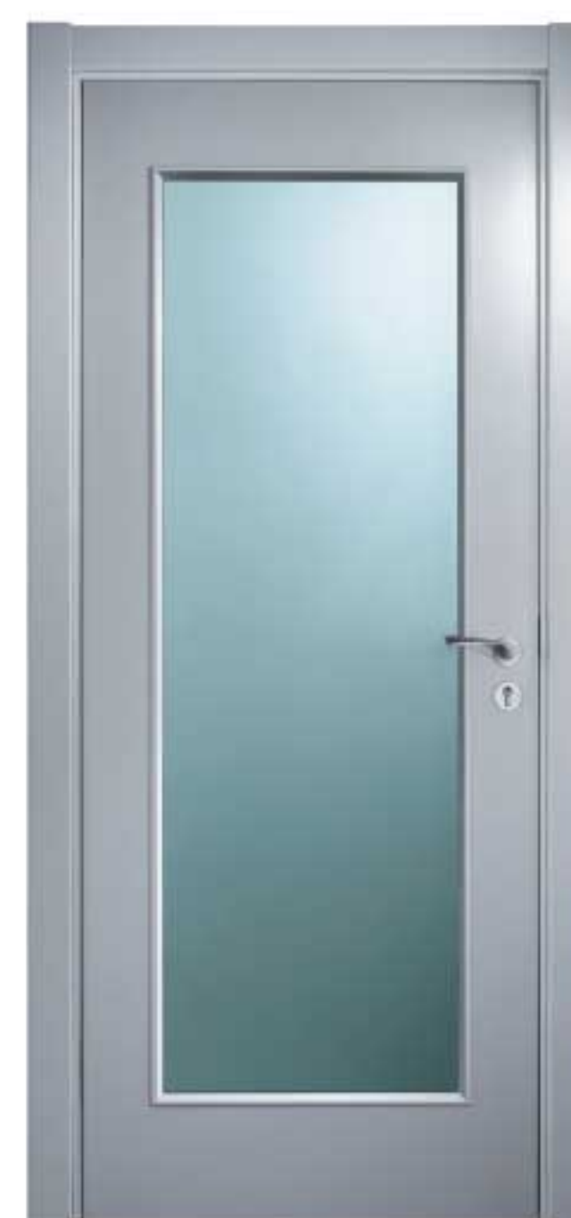
Code:MSXD02 Door: White matte Lacquer Frame: White matte Lacquer