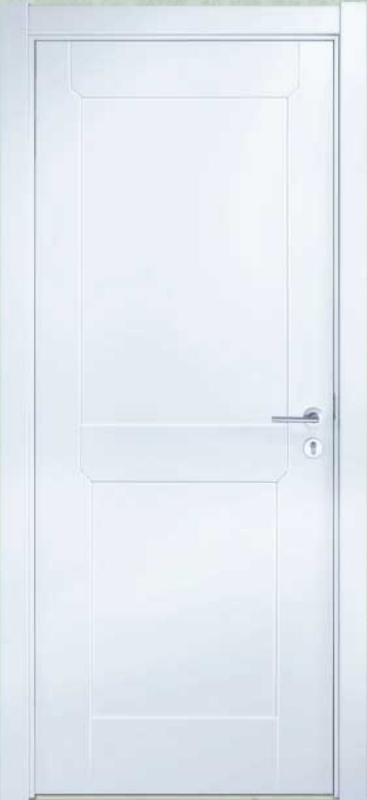
Code:MSTD02 Door: White matte Lacquer Frame: White matte Lacquer