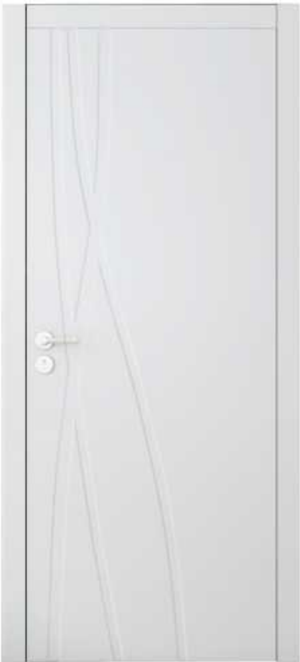
Code:MSPD05 Door: White matte Lacquer Frame: White matte Lacquer