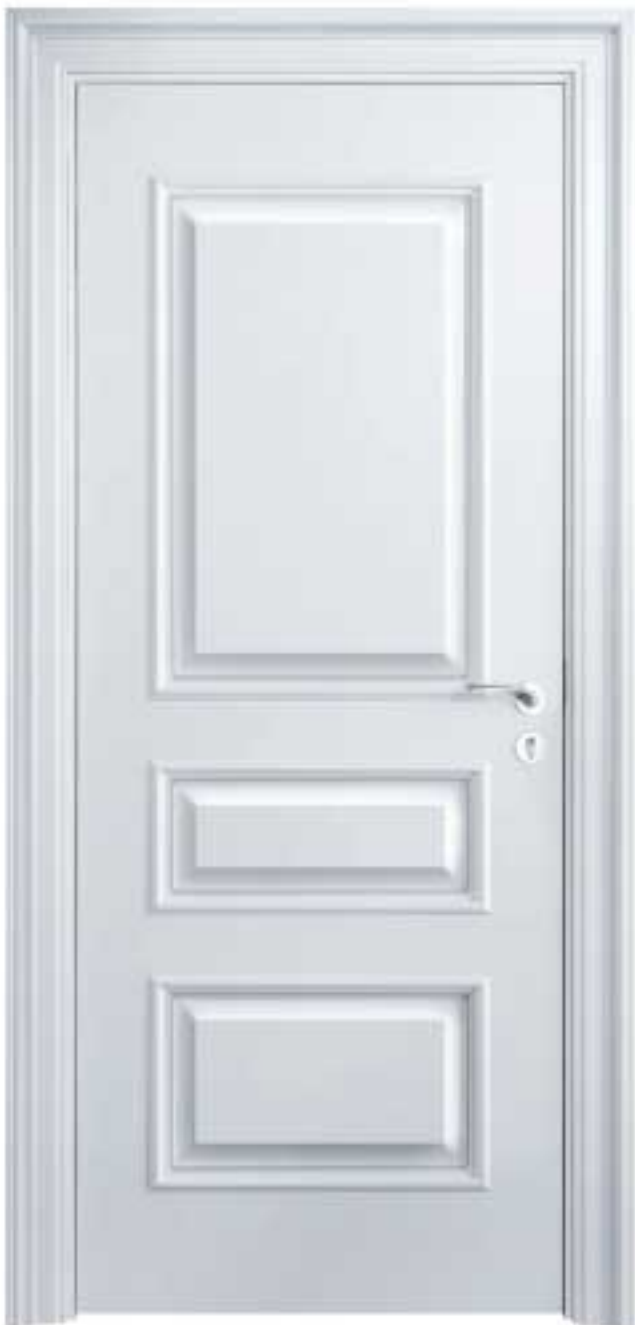
Code:MSGD05 Door: White matte Lacquer Frame: White matte Lacquer