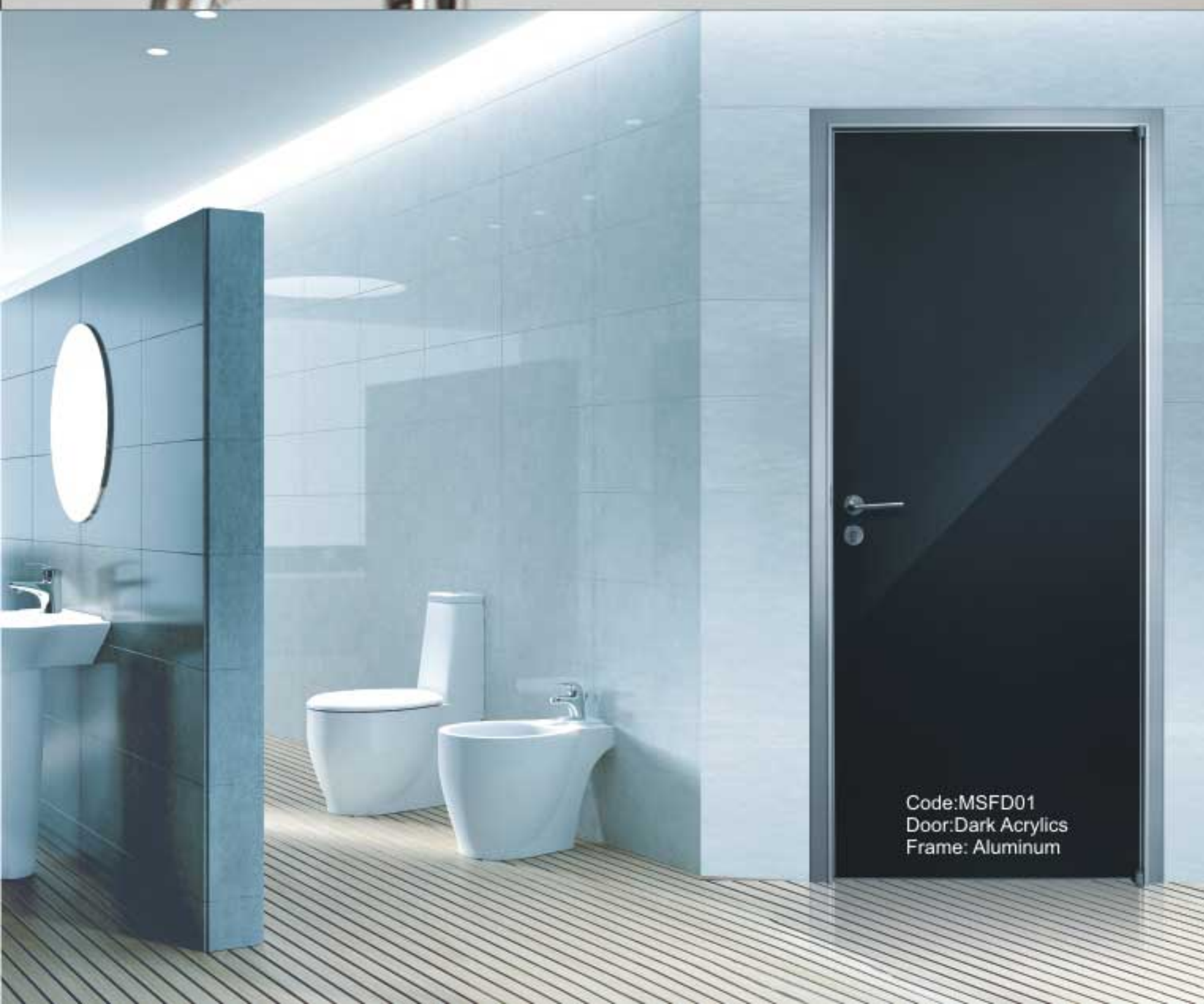
Code:MSFD01 Door: Dark Acrylics Frame: Aluminum