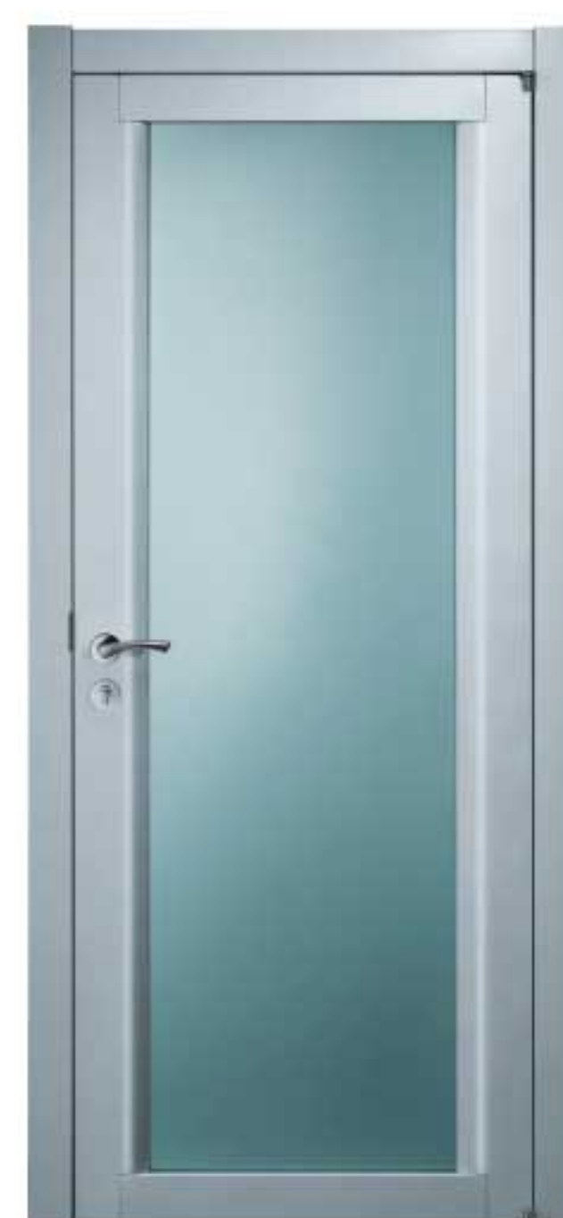
Code:MSTD03 Door: White matte Lacquer Frame: White matte Lacquer